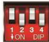
Large / Spanning