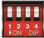
Normal / JBOD